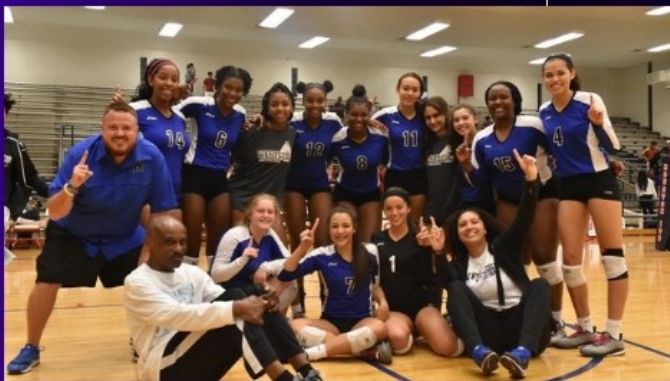
Undefeated District Champs